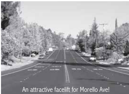
An attractive facelift for Morello Ave!

The project focused on providing cape sealing surface treatment for collector and arterial streets. The cape seal application is a two-step process: 1) Rubber Binder Chip Seal—the street is sprayed with rubberized asphalt binder and then rock is placed on top and compacted into the binder; 2) Micro-surface Seal—a mixture of asphalt liquid and fine rock is placed on top of the Rubber Binder Chip Seal to provide a final