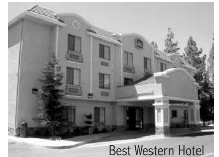
Best Western Hotel

This new hotel is located at 1432 Contra Costa Boulevard. The three-story building has 30 rooms/suites. The hotel was in construction for a number of years and was completed in early spring 2007.