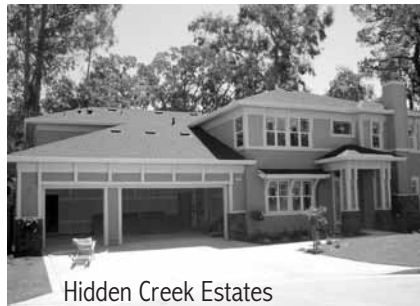
Hidden Creek Estates

This subdivision is located on Ava Lane, a newly constructed private road, off of Rainbow Lane and adjacent to Murderer's Creek. The five lots are 1/4 to 1/2-acre in size and feature two single-story models, ranging from 2,890 to 2,957 square feet, and a two-story model of 4,130 square feet. This residential project features innovative drainage systems that filters and retains storm water runoff prior to discharging into the creek. Construction is anticipated to be completed this summer.