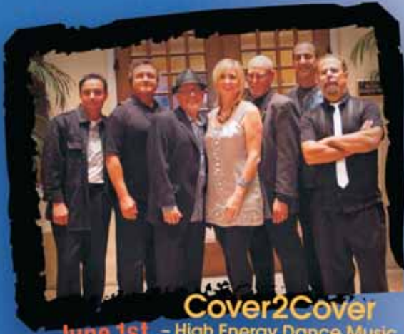
Cover2Cover June 1st - High Energy Dance Music