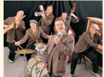
New this year...Stompy Jones!

Starting Memorial Weekend and continuing past Labor Day Weekend, the Downtown and City Hall locations will host twelve concerts with some of the top bands in the Bay Area.