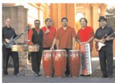
Jun 10... En Vivo