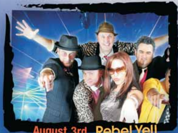
August 3rd Rebel Yell - 80's and more