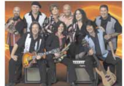
Aug 5... Fundamentals