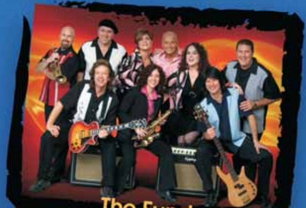
The Fundamentals September 7th - Red Hot Rockin' Soul

Park Downtown Pleasant Hill Parking Garage...where the parking is always FREE!