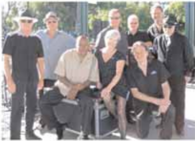
May 27... East Bay MUDD

And on Sep 2... a DOUBLE HEADER! 3:30-8:00pm