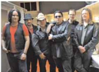
Jul 8... Petty Theft