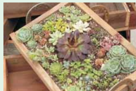
Hand-crafted garden trays, available at the plant sale, can be used for yardwork or decorative purposes.

Competitive prices make the sale a popular destination. Another benefit is that Master Gardeners will be available to