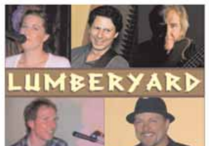
Sep 2... Lumberyard

Visit www.pleasanthillconcerts.com for all concert information.