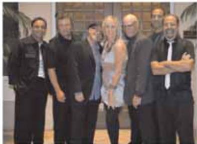
Aug 19... Cover2Cover